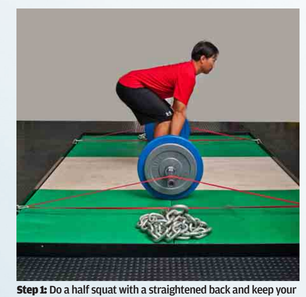
hands straight at all times. I have rubber bands on my weights to provide more stability.

Remember, a good posture leads to more power and accuracy on