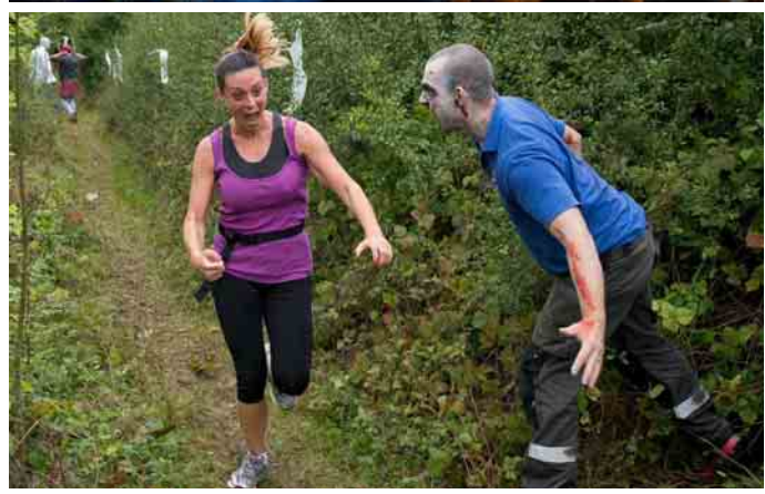
Runners are sprayed with dye during the Color Run (top); a zombie scares a participant in the Zombie Evacuation Race.

20 to 30 (43 per cent) and 40 to 50 (46 per cent). Nearly one in three respondents said they encouraged at least five friends to participate with them.